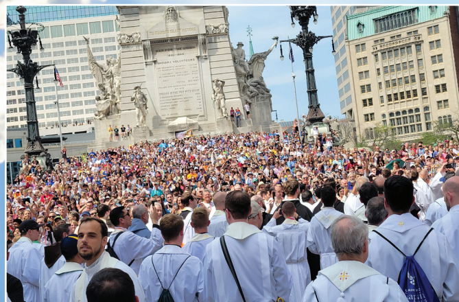
60,000+ pilgrims lined the streets at the National Eucharistic Congress in Indianapolis